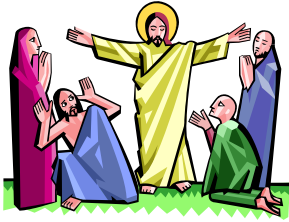
The Lord is Risen and He is with us! Praise to You, O Lord.